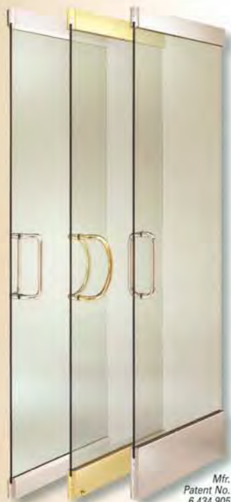
Mfr. Patent No. 6,434,905

The new Wedge-Lock Door Rail System provides the fastest fabrication and installation. Experienced installers can now secure a door rail in less than ten minutes. After rail installation to the glass, all that is needed before hanging the door is attachment of the appropriate arm or pivot to the unique, pre-installed adjustable slide-block. This standard feature on both top and bottom rails allows for door alignment without removing the door.