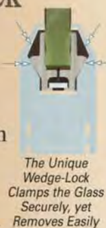
The Unique Wedge-Lock Clamps the Glass Securely, yet Removes Easily

Covering the Entire Spectrum of Doors with 4", 6" and 10" Rails in Five Beautiful Stock Finishes